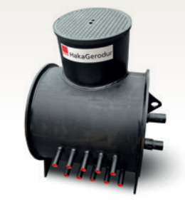
Distribution shaft Robust shaft solutions

We can customise watertight distribution shafts according to your specifications in a very quick turnaround. If it must be possible to walk on the manhole cover or if lorries are to drive over it, how should the outlets be designed? We make everything possible! Our robust distribution shafts have already proven themselves in numerous applications. You can rely on our expertise.